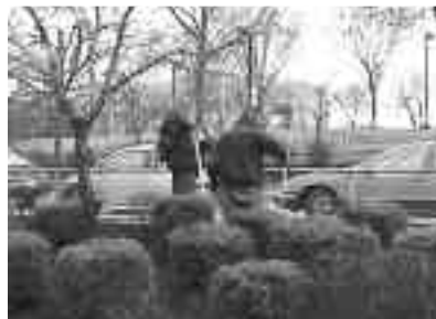
Crewmembers performing spring clean-up while trying to keep warm.

Committee is in the process of ordering new uniforms for the Crew. The process has been sluggish, according to Committee member Wuschke, due to several crewmembers' unwillingness to divulge their clothing sizes.