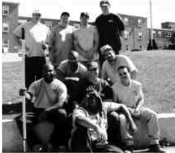
The Landscape Crew takes a break during a recent day at Franklin Hill.